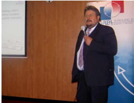
...and deinkability matters