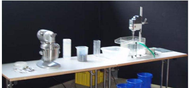
Jens Winters' practical demonstration station