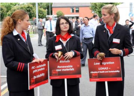
Friendly guidance from Siegwirk